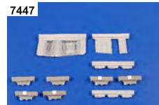
Beaufighter Mk.X Armament - Wing Gun Bays