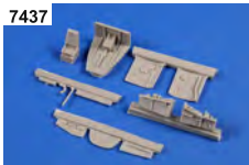
Beaufighter TF Mk.X Cockpit