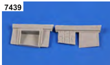
Beaufighter TF Mk.X Dinghy