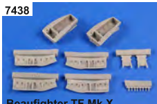
Beaufighter TF Mk.X Main Undercarriage Bays Correction